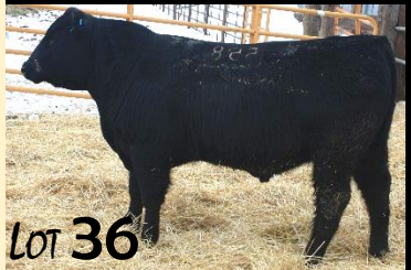
GLC Hercules 558