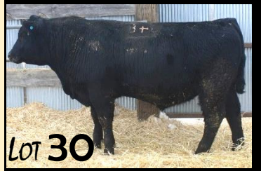
GLC Sleep Easy 348