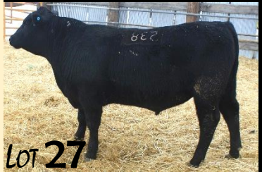
GLC Hercules 538