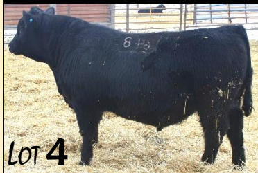
GLC West River 648