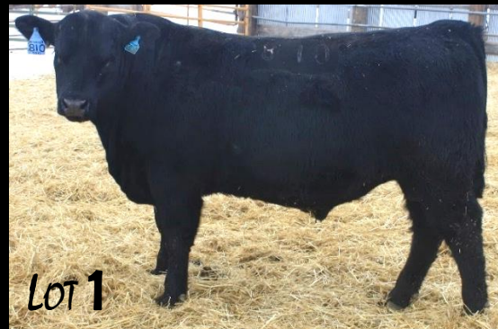
GLC Resource 018

SAV Resource 1441 VDAR Churchill 1063 B Bar Windy 7 3575 SAV West River 2066 VDAR Cedar Wind 1044 VDAR Cedar Wind 1064 GLC Huckleberry 496