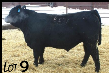
GLC Resource 028