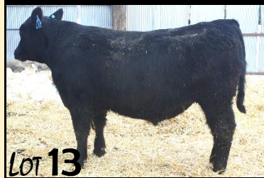
GLC Huckleberry 468