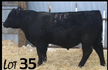
GLC Sleep Easy 378