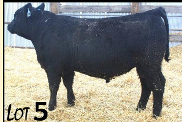
GLC Sleep Easy 358