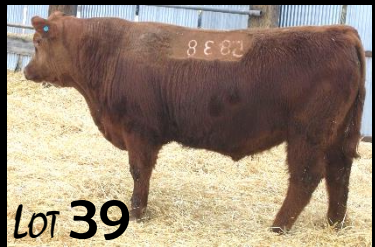
GLC Stetson 5838

HB +195 GM +48 CED +18 BW -4.4 WW +53 YW +90 M +31 ME -2