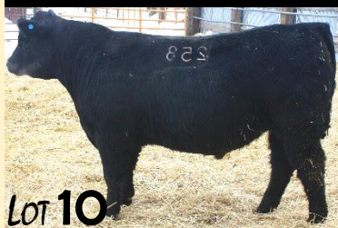
GLC Churchill 258