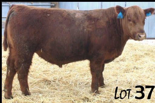
GLC Stetson 5388

HB 190 GM 49 CED +14 BW -1.5 WW +60 YW +102 M +30 ME +1