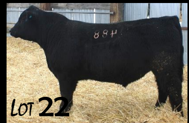
GLC Huckleberry 488