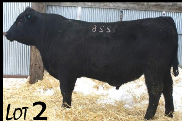
GLC Churchill 228