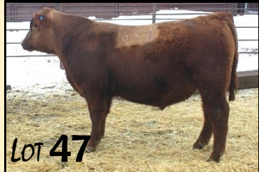
CCTS S Bar U Fusion 828

HB +203 GM +46 CED +17 BW -4.2 WW +52 YW +87 M +26 ME +0